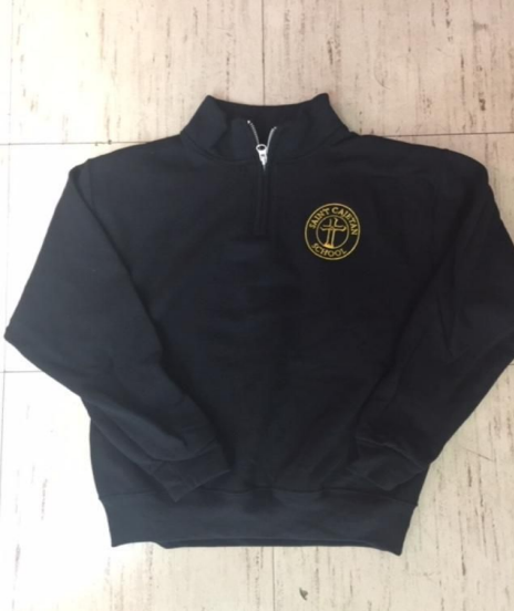
½ zip sweatshirt

Schools Are Us Schoolbelles Uniform Shoes for Boys Uniform Shoes for Girls