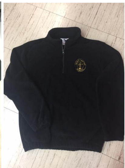
½ zip fleece