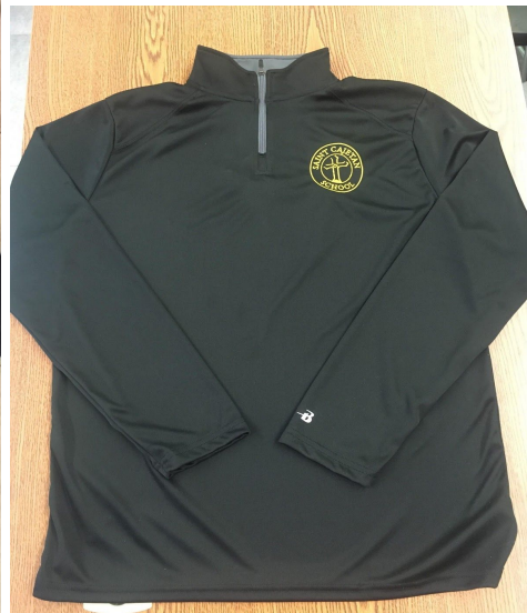
½ zip dri-fit